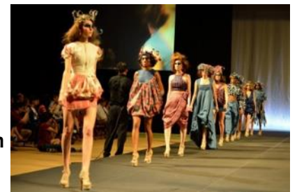
Models showcase students' designs during the 30th Annual Cornell Fashion Collective in 2014

The Cornell Fashion Collective, formerly the Cornell Design League, is a student-run organization that provides members of the Cornell community with an outlet to express creativity in fashion and fashion management. Each spring, the organization presents a professional runway show featuring the talent of students who both design apparel and manage the operations of the show. The organization gives students, both undergraduate and graduate, the opportunity to practice design, demonstrate their talents, and learn how to produce a large-scale fashion event.