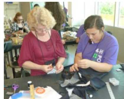
4-H Participants design and create dresses from blazers during the Fashion Chop Shop Program during the 2014 Career Explorations.